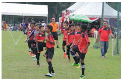
RSC under-12 warming up

included a charity element – the RSC hosted 20 children from Shepherd’s Home Dengkil, a non-profit, independent organisation founded in 2002 to provide single mothers better living conditions, financial assistance and education for their children. The children from the home had a fun-filled day watching the games, enjoying a swim at the Club pool, as well as lunch and ice-cream treats. The RSC Soccer Section and individual members also came together to make financial contributions to the home.