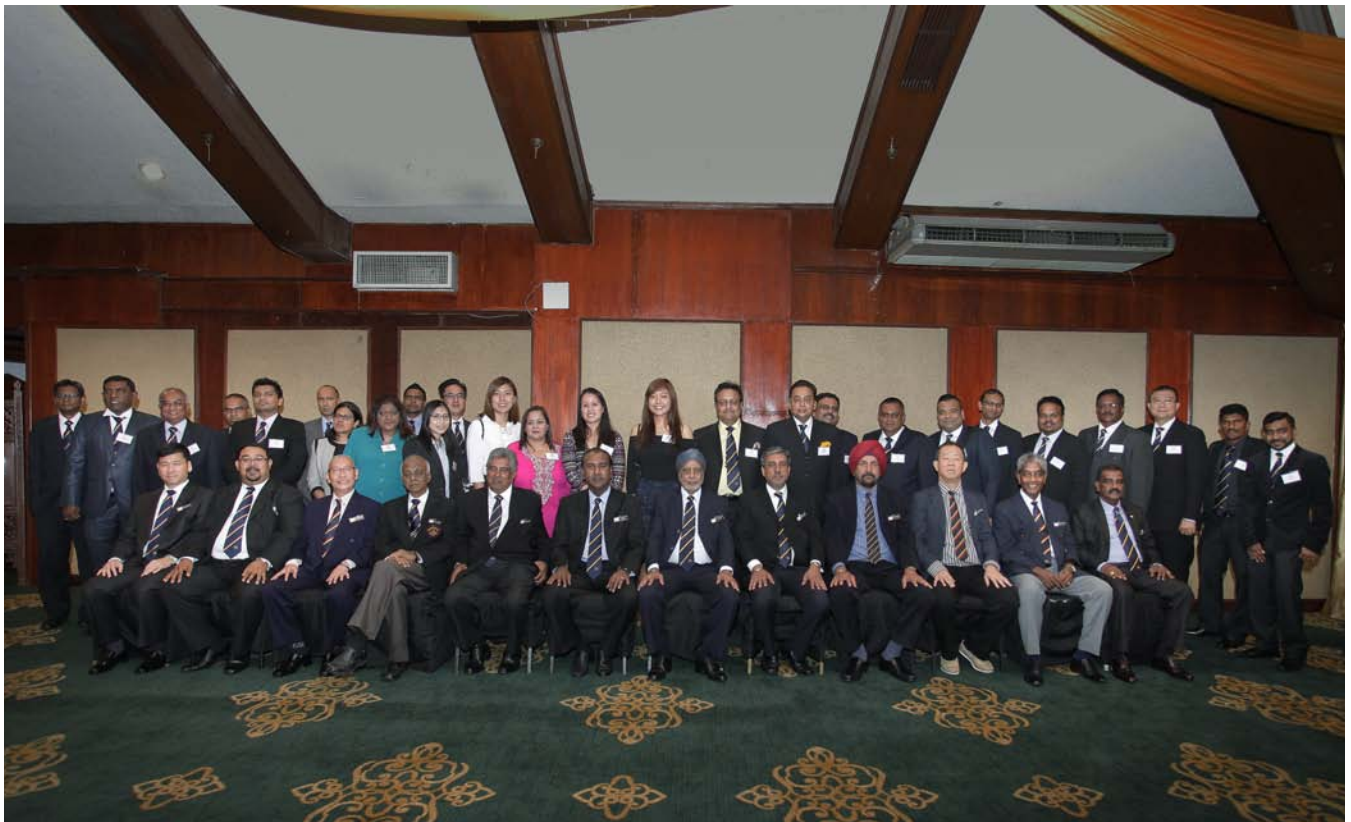
The General Committee and the New Members Elect

As to be expected, the guests and members continued to recharge their glasses before adjourning to the Cellar and the Cocktail Lounge for an extended evening of merriment.