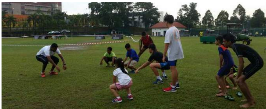
Participants warming-up for the Biathlon