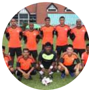
INTERNATIONAL SOCCER 7S