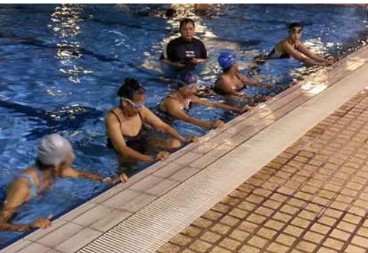
Ladies swimming session

The Swimming Section introduced ladies only swimming class on 27 August 2016. Response was good with 10 persons signing-up to learn swimming with our able coach. Those interested, please sign-up. The classes are held every Saturday at 7.30pm.