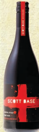
Allan Scott Scott Base Pinot Noir 2013 New Zealand

Normal Price: RM111 RSC Member Price: RM93