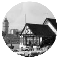
OUR CLUB'S COLONIAL PAST