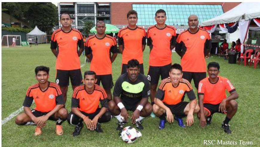
RSC Masters Team

In the true football spirit of caring and sharing, the event also