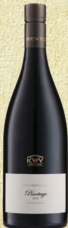
KVV The Mentors Pinotage 2013 South Africa

Normal Price: RM138 RSC Member Price: RM95