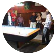
INTERPORT WITH SINGAPORE CRICKET CLUB